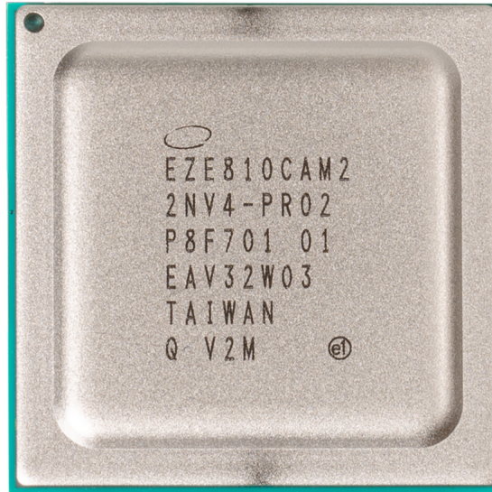
Figure 1-1. Example Component with Identifying Marks